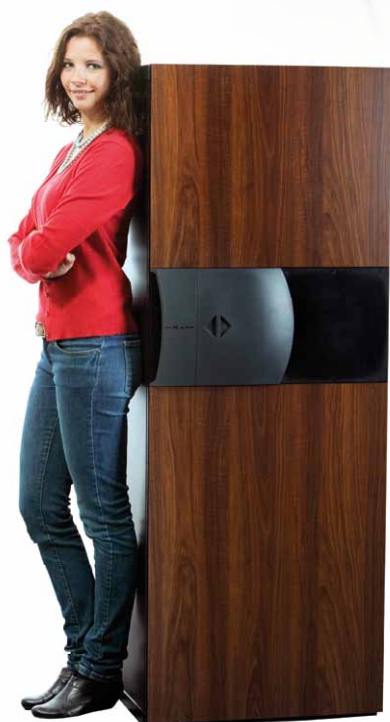
In picture Keeps® E-400 model with mahogany panel.