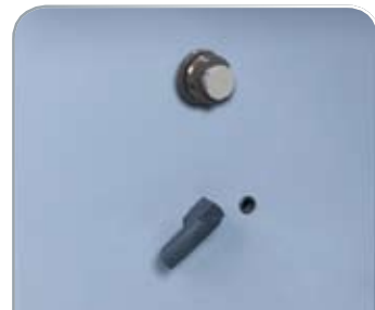
MxB + MC4