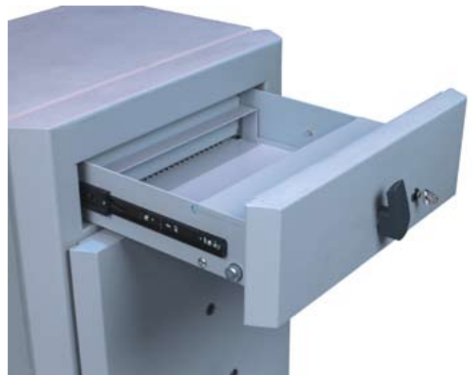
Millium Deposit Express has been designed for easy installation under a cash desk