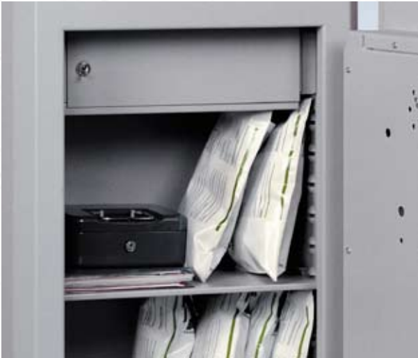
Interior fittings (from left): Shelf, lockable compartment

Millium can be fitted with shelves and a lockable compartment to help you get the most out of the safe's interior space.